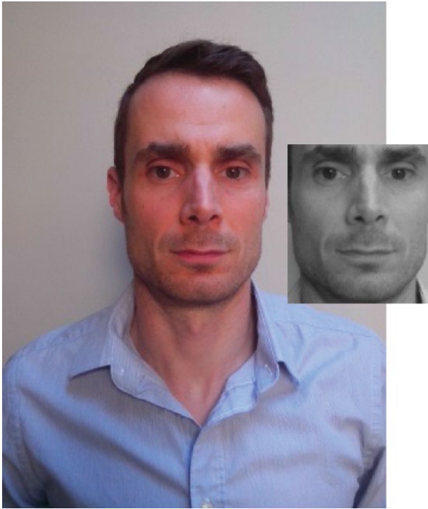
Fig. 2. Cooperation detection based on static pictures is inconsistent—but degrading the informational content of pictures, as illustrated here, may increase accuracy. Full pictures can be cropped at the ears, eyebrows, and chin in order to display only inner features of the face. Makeup and skin tone can be de-emphasized by converting the picture to grayscale.

Figure 2 (Bonnefon, Hopfensitz, & De Neys, 2013; De Neys, Hopfensitz, & Bonnefon, 2013, 2015; Stirrat & Perrett, 2010). Why is that? One possible reason is that transformed pictures help people to focus on the signal (inner features) and ignore the noise (clothing, hairstyle, etc.). Another possible reason is that transformed pictures discourage people from thinking too much. The idea here is that just as the unconscious mind is better than the conscious mind at detecting lies (ten Brinke et al., 2016), intuitive processing may result in better cooperation detection than reflective processing.